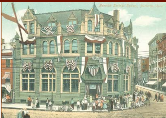
Norwich Savings Society - Historic Photo