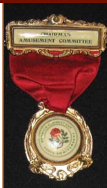
1859 Amusement Committee Chairman Badge